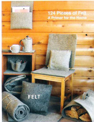
124 Pieces of Felt A Primer for the Home