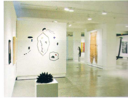
multiple works 2010 exhibition Design at Riverside, Cambridge Galleries