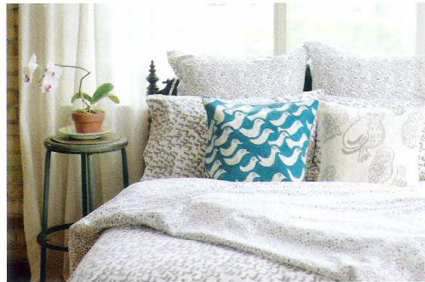
Virginia Johnson Bedding 100% Cotton Assorted Block Printed Bed linens 100% Wool Chain-stitch pillows