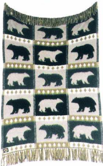
Laura Friedland Design, Bear Throw , White 63" x 50" 100% brushed Merino wool