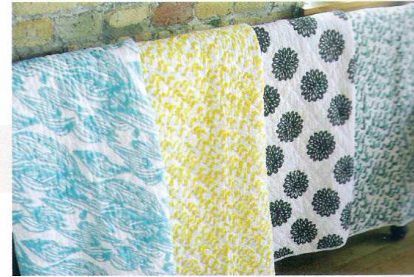
Virginia Johnson Bedding 100% Organic Cotton, various sizes